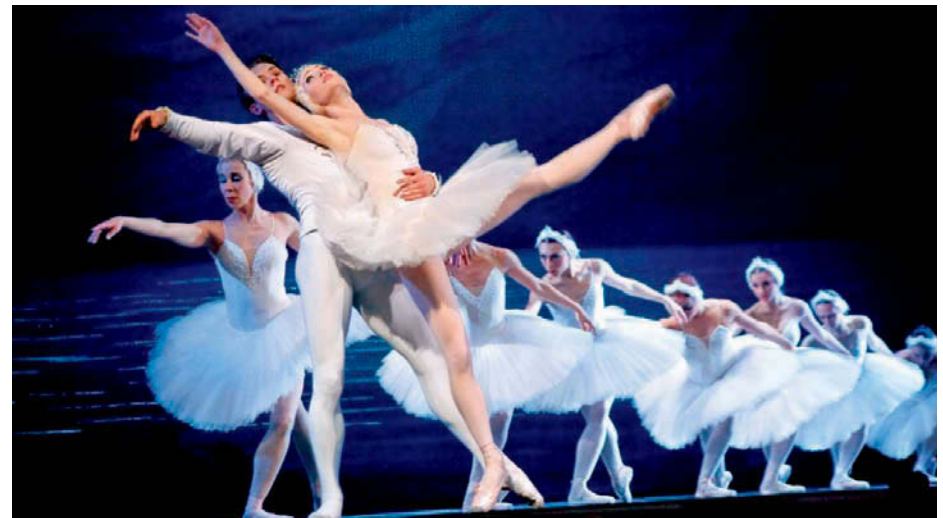
A Russian ballet, St. Petersburg, Russia